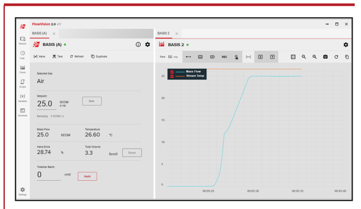
Communicates with our free FlowVision 2.0 software